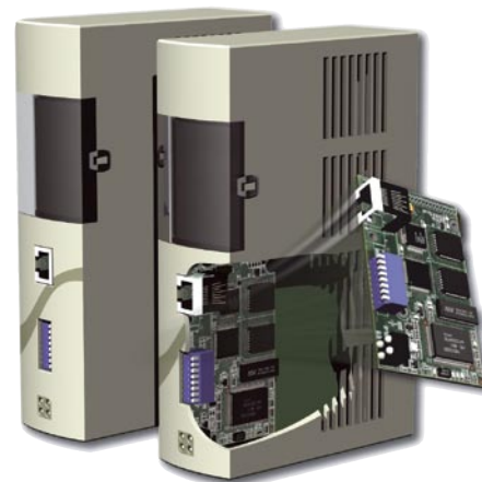
Example of a motion controller using Anybus-S Ethernet as its communication card

Data exchange between the Anybus-S and the field device is handled by control registers, which specify the size of the I/O area and the watchdog interval between the module and the device. In addition, the application software interface provides module related data such as the network type, vendor information, software and hardware versions and the serial number of the module.